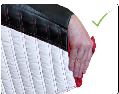
Position for belly flight. Palm rests against arm wing end cell. Gripper provides structure. Hand "palms" arm wing end cell.

GOOD: Pilot's fingers are all on the top surface (back side) of the gripper, resting against the arm wing end cell. The grip is somewhat relaxed, with the thumb in front and the top of the gripper nestled gently in the palm of your hand. Note that the gripper itself is not being held tightly.