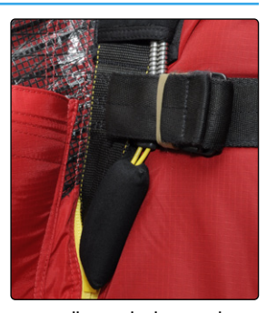
Handles completely exposed. Zippers tight against MLW.

NOTE: If you think that the zipper system is not functioning well with your skydive harness (i.e. your emergency handles are not always 100% accessible), please contact us immediately before your next jump. You may need to modify the zippers so that the sliders stay locked in place, as per the information at this URL: <a href="http://squirrel.ws/zipperstuff">http://squirrel.ws/zipperstuff</a>